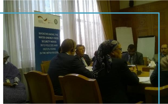
NEXUS Workshop at LAS - Cairo