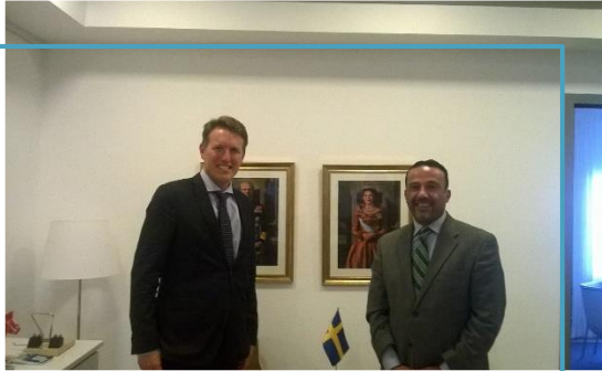
Embassy of Sweden - Tunisia