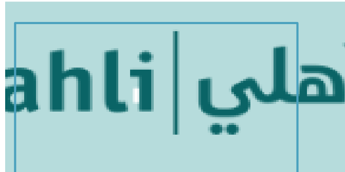
Private Sector Partnerships